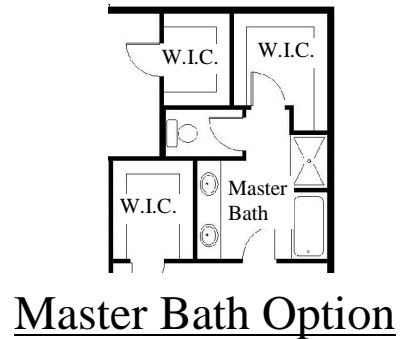
Master Bath Option