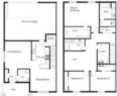
Main Floor Upper Floor

3 Bedrooms 2.5 Bath - 2400 Sq. Ft. - 2-Car Garage